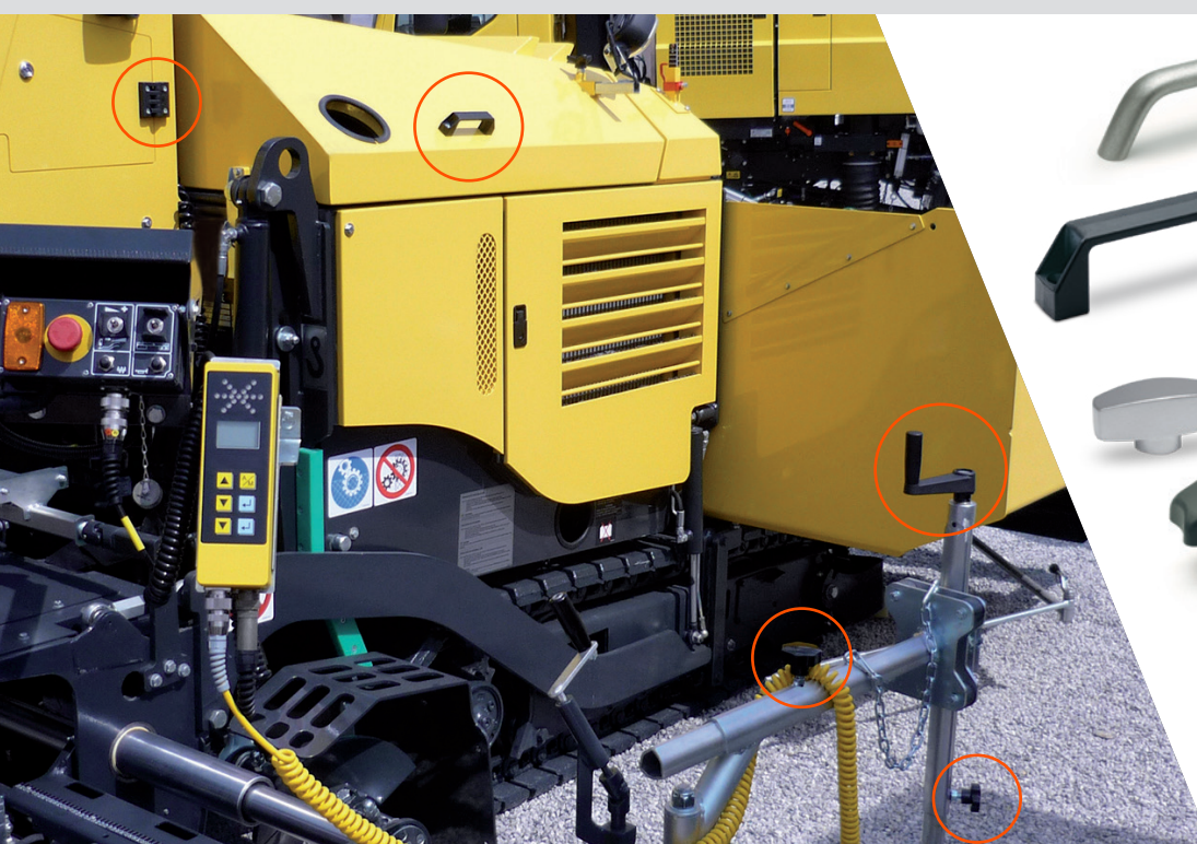
Application of (clockwise) M.443 technopolymer U-handle, MT. technopolymer crank handle, VC.192 Duroplast clamping knob, CFA. technopolymer hinge