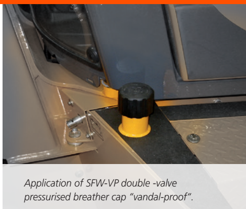
Application of SFW-VP double-valve pressurised breather cap "vandal-proof".