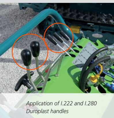
Application of I.222 and I.280 Duroplast handles