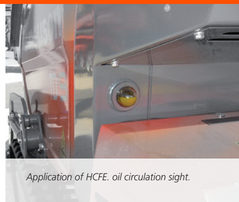
Application of HCFE. oil circulation sight.