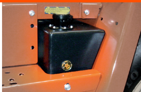
Application of HFTX. oil level indicator.

More than 25 different types of column level indicators with or without thermometer and protection frame. Also available with electrical sensor or probe for MAX temperature and MIN level. The body of the indicator, entirely in transparent technopolymer, is assembled using ultrasonic welding to guarantee a perfect seal ensured by 100% electronic control during production. A progressive serial number for the traceability of every single indicator is laser engraved on its rear side. Total compatibility with commonly used chemicals, hot water and alcohol together with the utmost resistance to shocks represent additional features that make ELESA range unique.