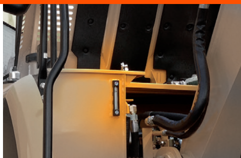
Application of HCZ-P with SUPER-Technopolymer protection frame.