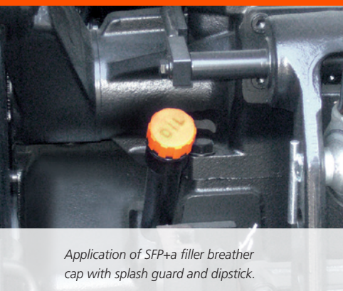
Application of SFP+a filler breather cap with splash guard and dipstick.

ELESA presents a wide range of standard elements in engineering plastics and metal for equipment and machinery for the construction and building industry which operate in particularly unfavourable conditions and sometimes in explosive atmosphere. High or low temperatures, high humidity, high pressure and contact with different chemical substances are some of the most common conditions of use. Therefore, reliable components in functionality, quality and performance are essential and of the utmost importance.