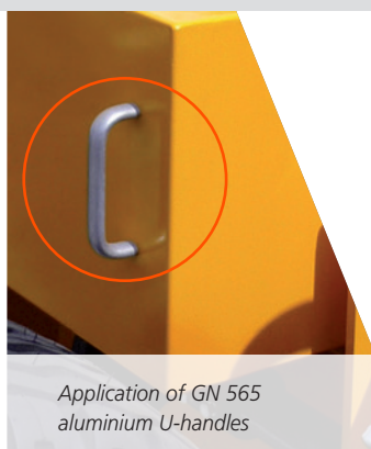
Application of GN 565 aluminium U-handles