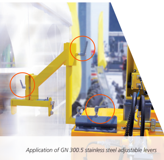
Application of GN 300.5 stainless steel adjustable levers

An extensive range of clamping knobs and adjustable levers ; lift, pull and revolving handles; control knobs and control levers ; hinges all made in special technopolymer resistant to solvents, oils, greases and other chemical agents or aluminium, zinc-plated steel or stainless steel with the greatest care in surface finishing. Ergonomics combined with a unique design, a well-proven quality and a perfect functionality.