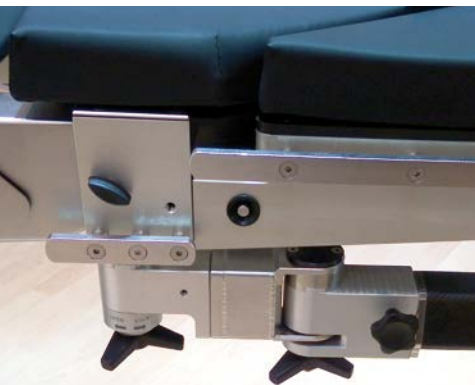
Clamping knobs and wing knobs in technopolymer with stainless steel inserts.