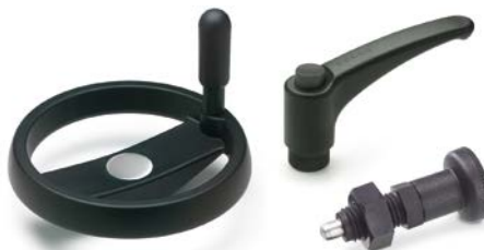
VRTP-I, ERX., PMT.100