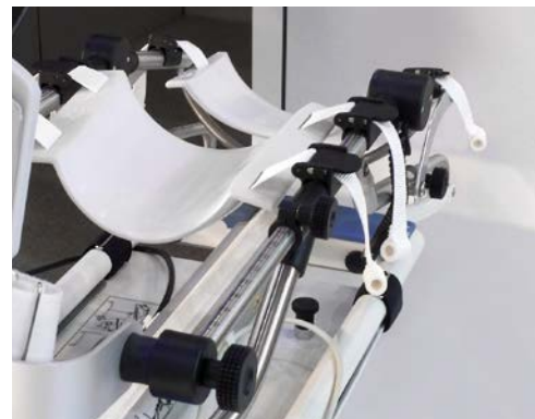
Clamping knobs and positioning elements in technopolymer and zinc-plated inserts.