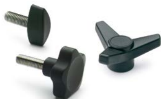
CT.476, VC.692, VB.639