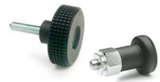
MBT., GN 607.2