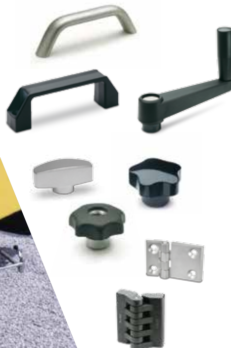
Application of (clockwise) M.443 technopolymer U-handle, MT. technopolymer crank handle, VC.192 Duroplast clamping knob, CFA. technopolymer hinge