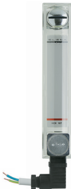
ELESa Original design