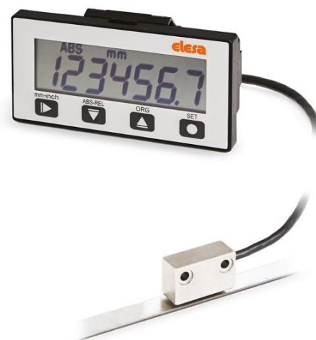
Magnetic measuring system MPI-R10 completed with its components: multifunctional LCD display, magnetic sensor with cable FC-MPI, and magnetic band M-BAND 10.

The last component is the magnetic band M-BAND-10 which is made of two separate parts: the magnetic band and the cover strip. The magnetic band is made of a magnetic tape, a carrier strip and an adhesive tape. The cover strip is made of a protection strip and an adhesive tape. The magnetic band maximum length is up to 25 m.