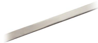
M-BAND-10 | Magnetic band