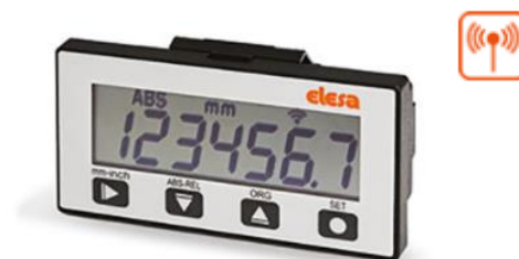
MPI-R10-RF | Magnetic measuring system

Product technical data sheets, along with drawings and tables with codes and dimensions are available on our website elessa.com .