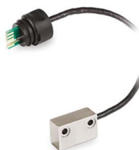
FC-MPI | Magnetic sensor