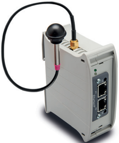
ELESÄ Original design

The control unit "W2" version is compatible exclusively with the electronic indicators and the magnetic measuring systems of the same "W2" version.