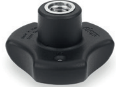
ELESA Original design