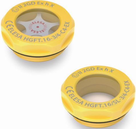
ELESa Original design

Brass nut GH. (see page 1574) for fitting to reservoirs with wall thickness smaller than 5 mm.