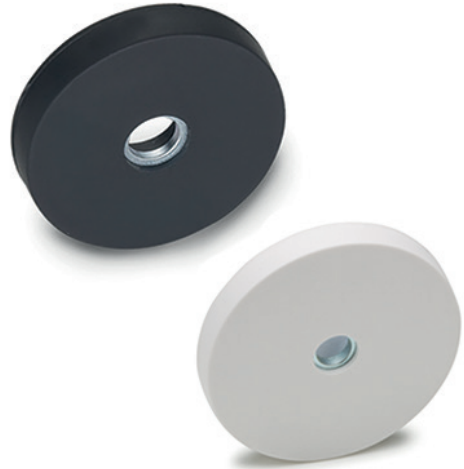
RMI-ND (D=22 / 57 / 66)

The elastomer surface increases the friction coefficient when lateral retaining forces are present, giving a better adhesion. These magnets are preferably used for sensitive surfaces.