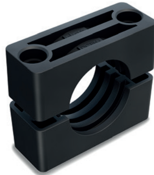
Correspondence between the DIN 3015-2 group and the DCE-H group