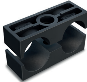
Correspondence between the DIN 3015-2 group and the DCE-H group